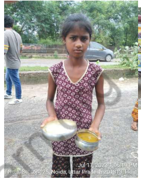
Jul 17, 2023 1:05:19 PM University Gate No.1, Sector 125, Noida, Uttar Pradesh 201313, India