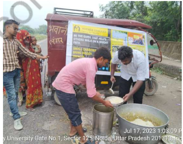
Jul 17, 2023 1:03:09 PM University Gate No.1, Sector 125, Noida, Uttar Pradesh 201313, India