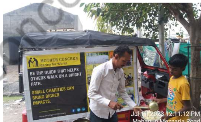
Jul 11, 2023 12:11:12 PM Mahagun Mezzaria Road