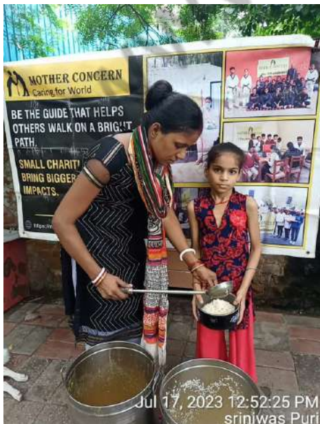
Jul 17, 2023 12:52:25 PM sri ni was Puri