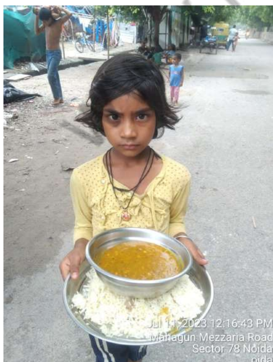
Jul 11, 2023 12:16:43 PM Mahagun Mezzaria Road Sector 78 Noida oida