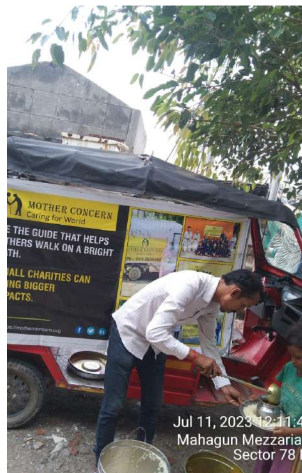
Jul 11, 2023 12:11:4 Mahagun Mezzaria Sector 78 N