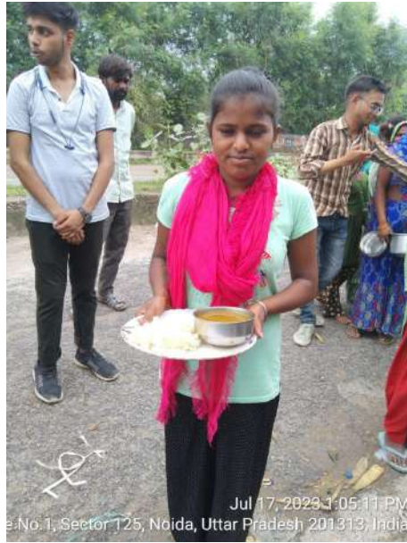
Jul 17, 2023 1:05:11 PM University Gate No.1, Sector 125, Noida, Uttar Pradesh 201313, India