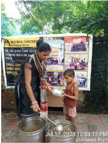
Jul 17, 2023 12:53:13 PM sri ni was Puri