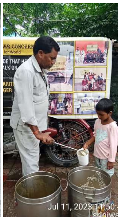
Jul 11, 2023 11:50:4 sri niwa