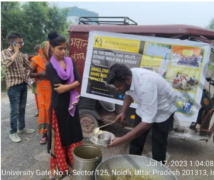
Jul 17, 2023 1:04:08 PM University Gate No.1, Sector 125, Noida, Uttar Pradesh 201313, India