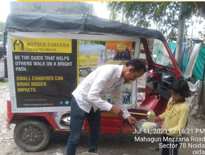
Jul 11, 2023 12:16:21 PM Mahagun Mezzaria Road Sector 78 Noida oida